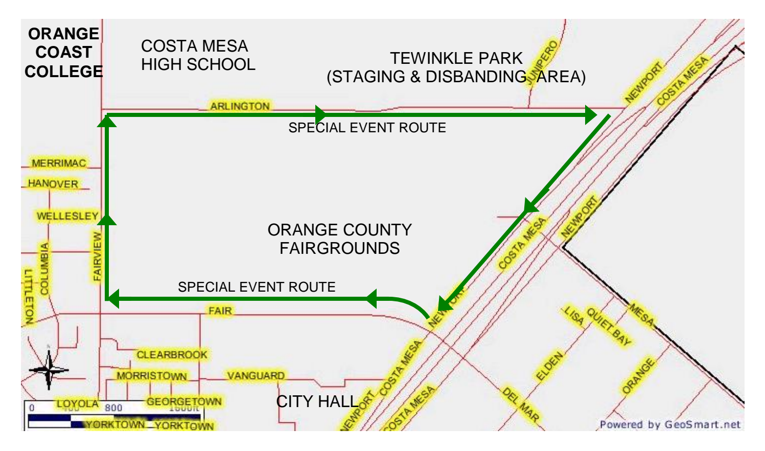
SPECIAL EVENT - PARADE ROUTE - AREA 3 FAIRGROUNDS AREA ROLLING PARTIAL 1/2 STREET CLOSURE