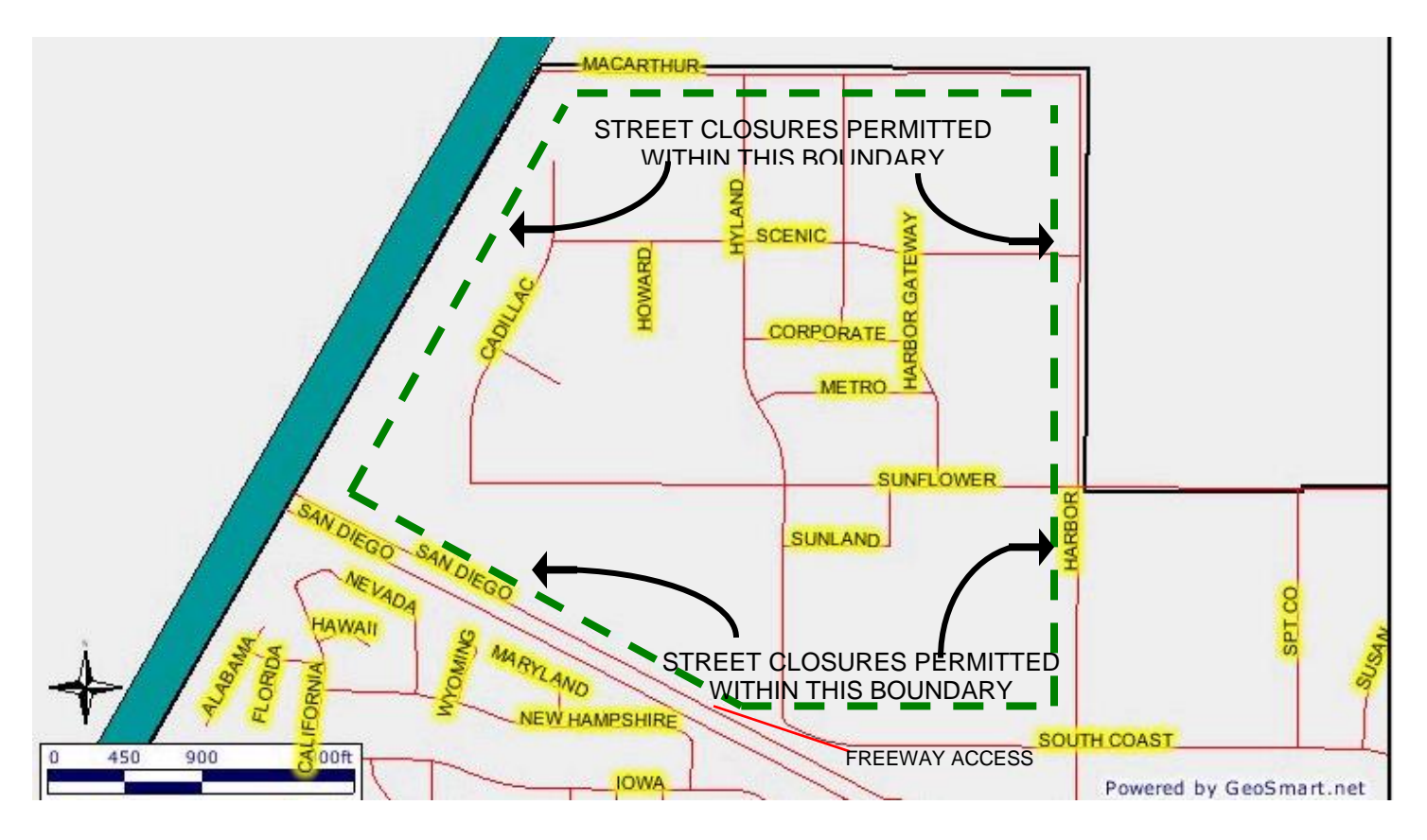
SPECIAL EVENT AREA 1 HARBOR GATEWAY FULL STREET CLOSURES