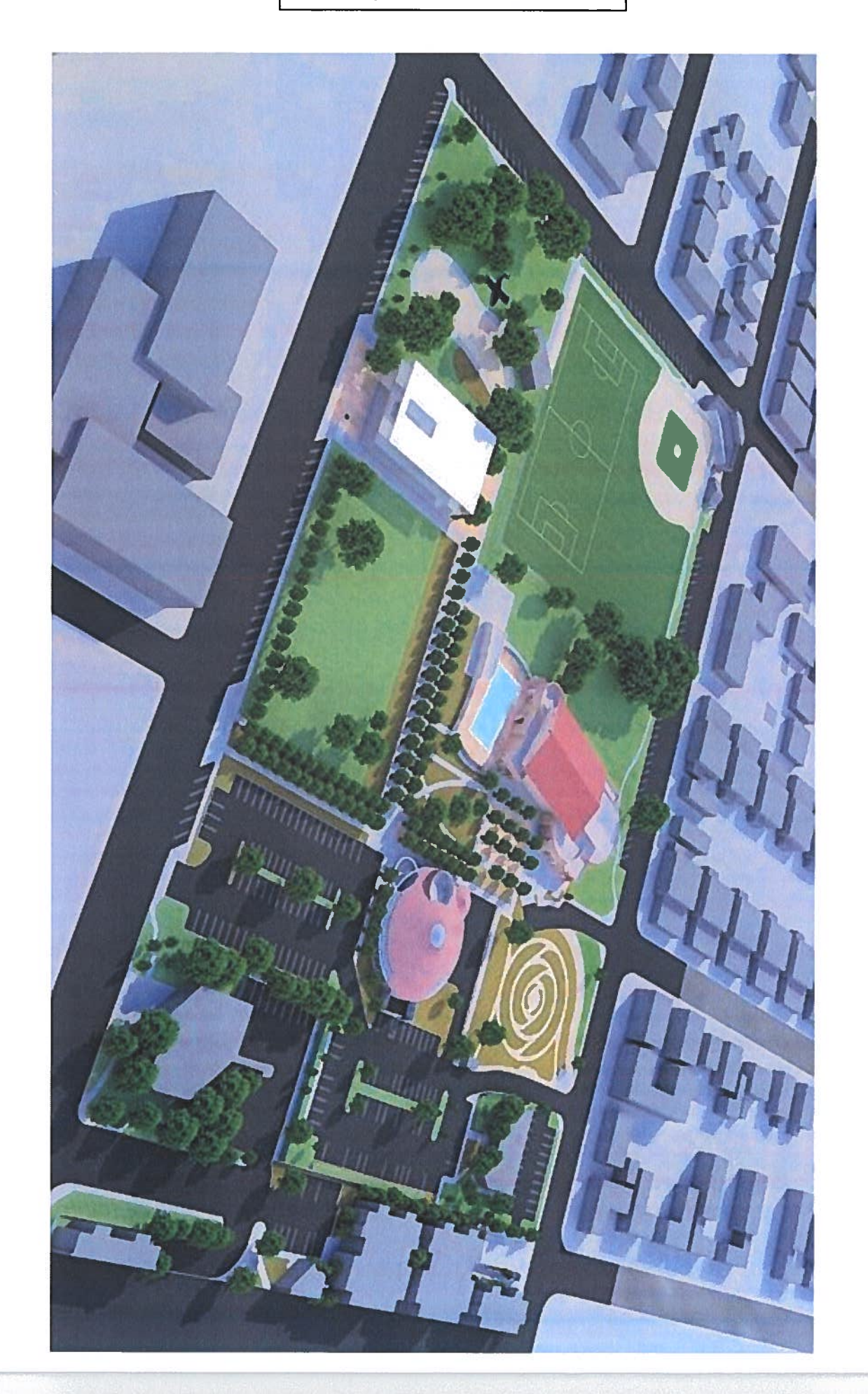
Exhibit A Description of Licensed Area