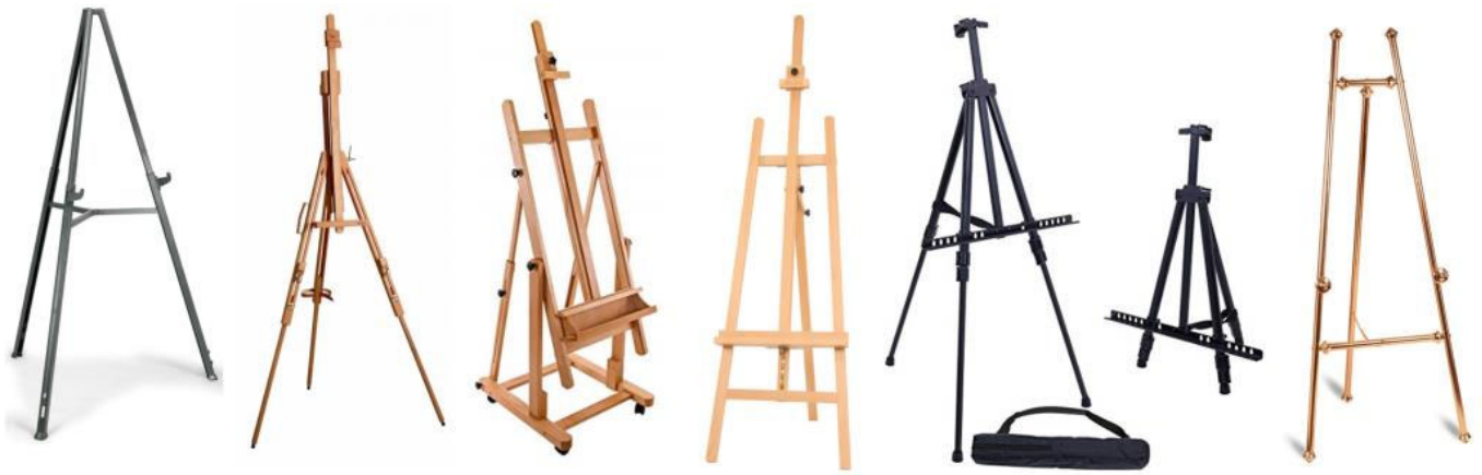
Not Acceptable Standing Easels: