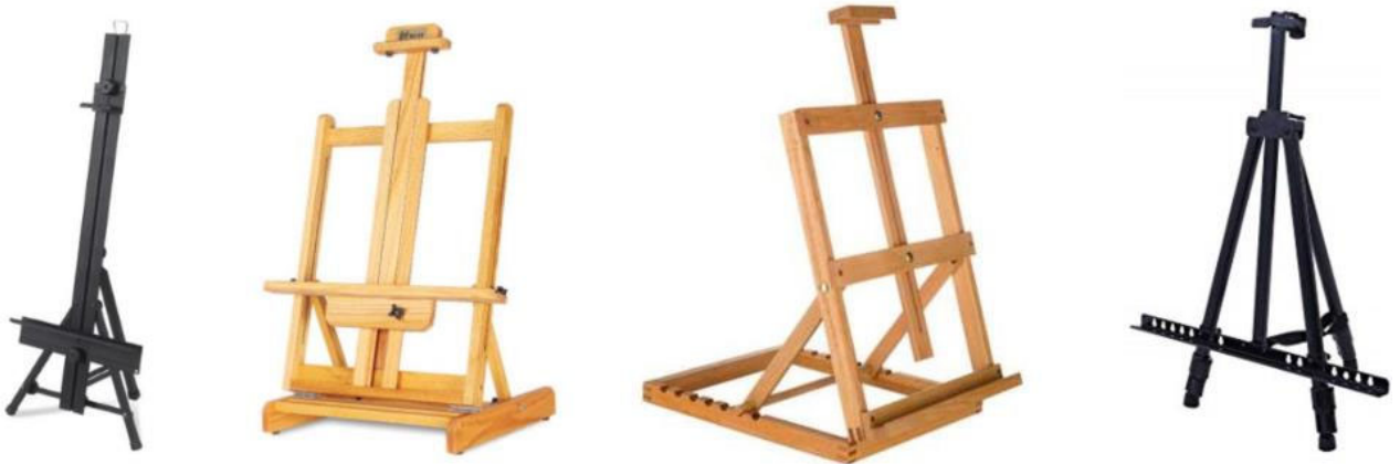
Not Acceptable Tabletop Easels: