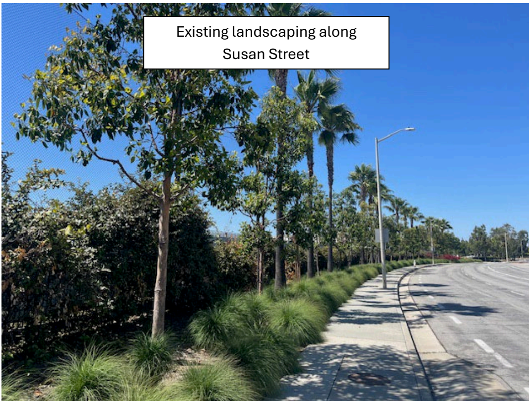
Existing landscaping along Susan Street