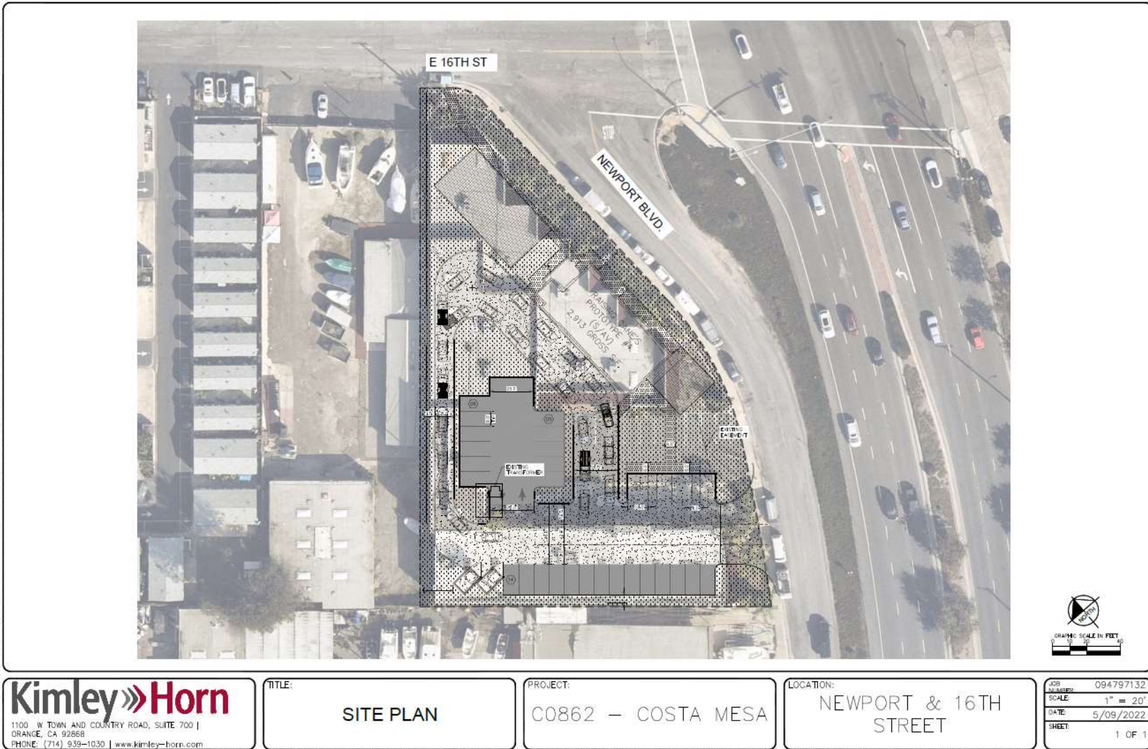
Exhibit 1: Site Plan