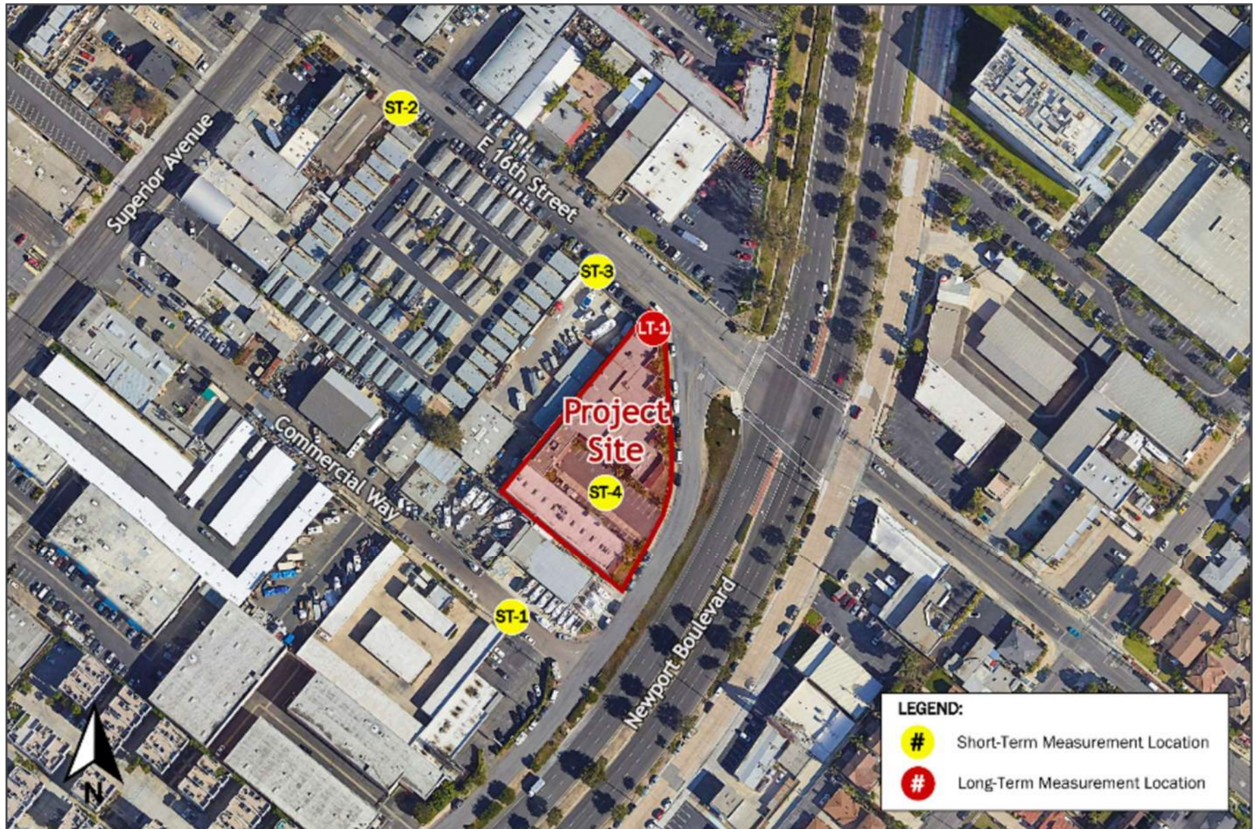
Exhibit 2: Noise Measurement Locations