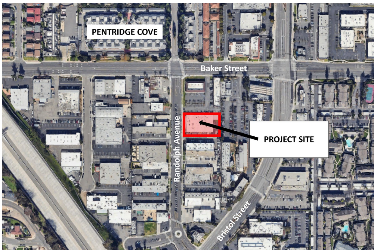
EXHIBIT 1: LOCATION MAP

Arena OC is located at 2968 Randolph Avenue (see the below Exhibit 1) and is currently operating under previously approved City land use entitlements. It is situated on the east side of the street between Baker Street and Bristol Street in the same tenant space formerly occupied by "The Commissary". The applicant is the same business operator as "The Commissary".