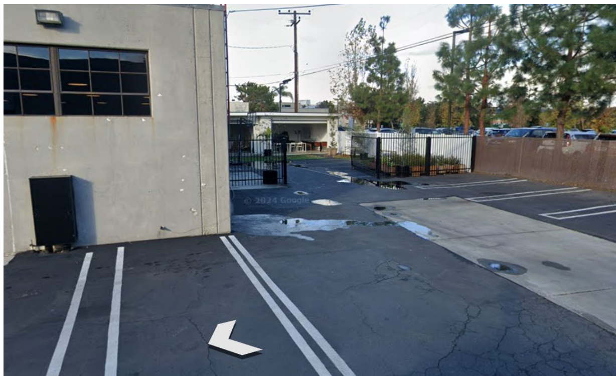
EXHIBIT 3: ON-SITE GROUND LEVEL VIEW

Separately, staff will be working with the brewery to determine if this outdoor area can be permitted subject to applicable City codes, or require the benches to be removed. However, as a result of the unpermitted picnic benches encumbering two parking spaces, and the unpermitted storage building encumbering approximately five parking spaces, the actual available parking for the use is less than approved.