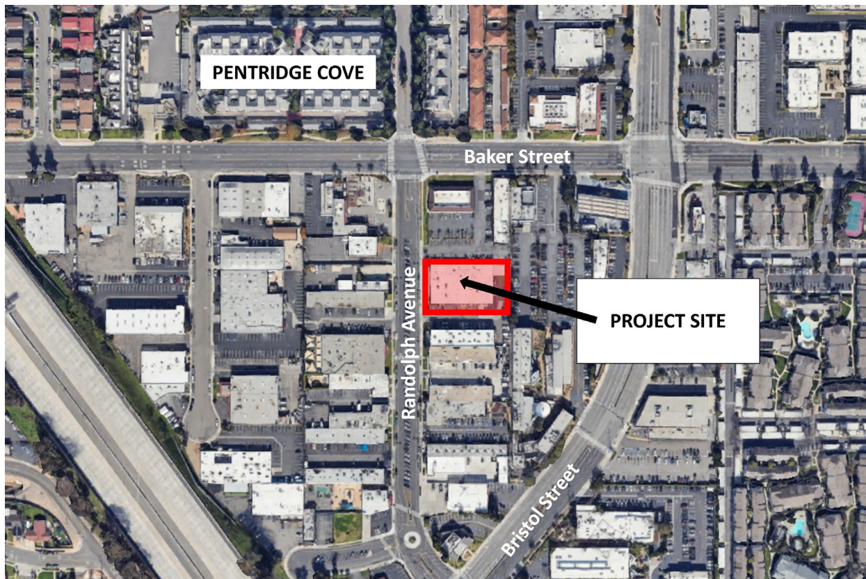
EXHIBIT 1: LOCATION MAP

Arena OC is located at 2968 Randolph Avenue (see the below Exhibit 1) and is currently operating under previously approved City land use entitlements. It is situated on the east side of the street between Baker Street and Bristol Street in the same tenant space formerly occupied by "The Commissary". The applicant is the same business operator as "The Commissary".