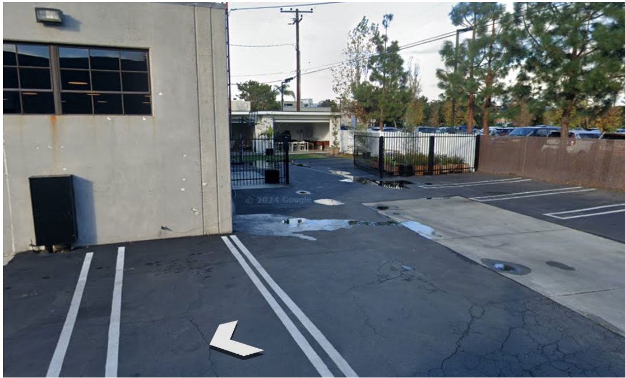
EXHIBIT 3: ON-SITE GROUND LEVEL VIEW

Separately, staff will be working with the brewery to determine if this outdoor area can be permitted subject to applicable City codes, or require the benches to be removed. However, as a result of the unpermitted picnic benches encumbering two parking spaces, and the unpermitted storage building encumbering approximately five parking spaces, the actual available parking for the use is less than approved.