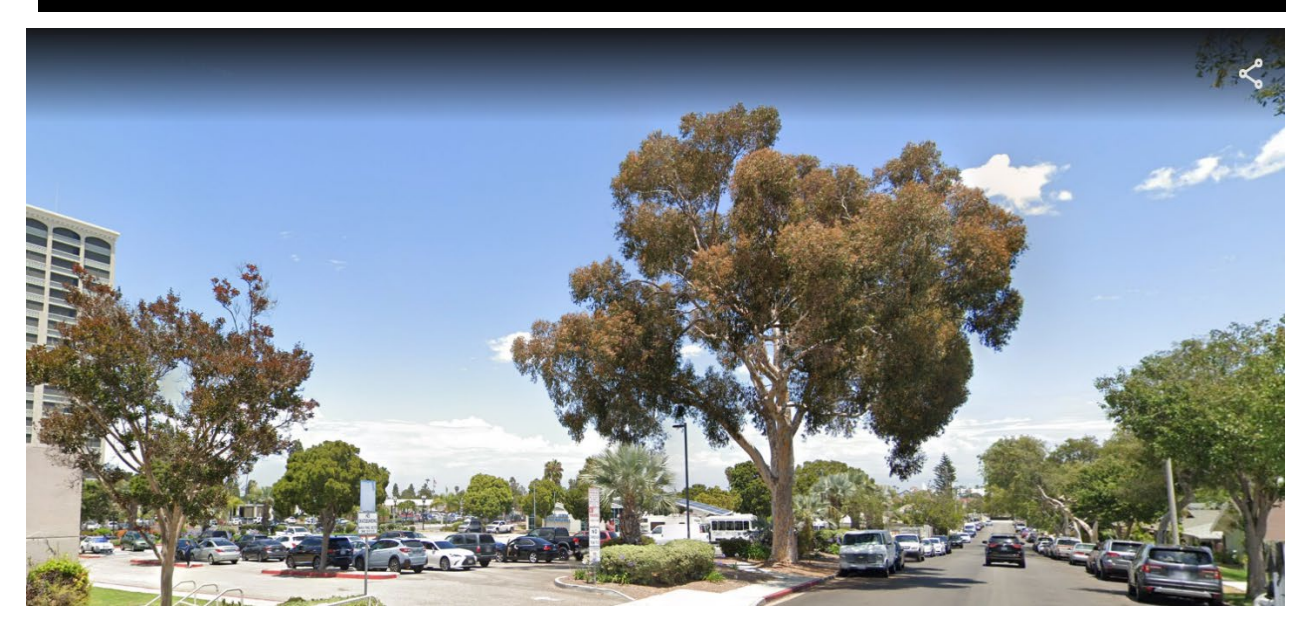
Exhibit 3 Eucalyptus Tree To Be Removed

removal of an existing eucalyptus tree, parkway landscaping along Plumer Street will be protected in place. Removal of the aforementioned tree was recommended by a certified arborist as the root crown decay has significantly affected the tree's structural stability.