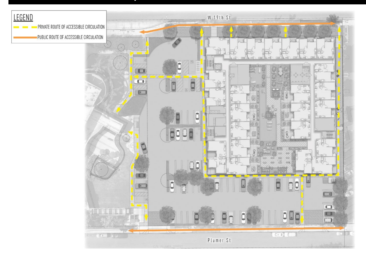
Exhibit 4 Pedestrian Connectivity