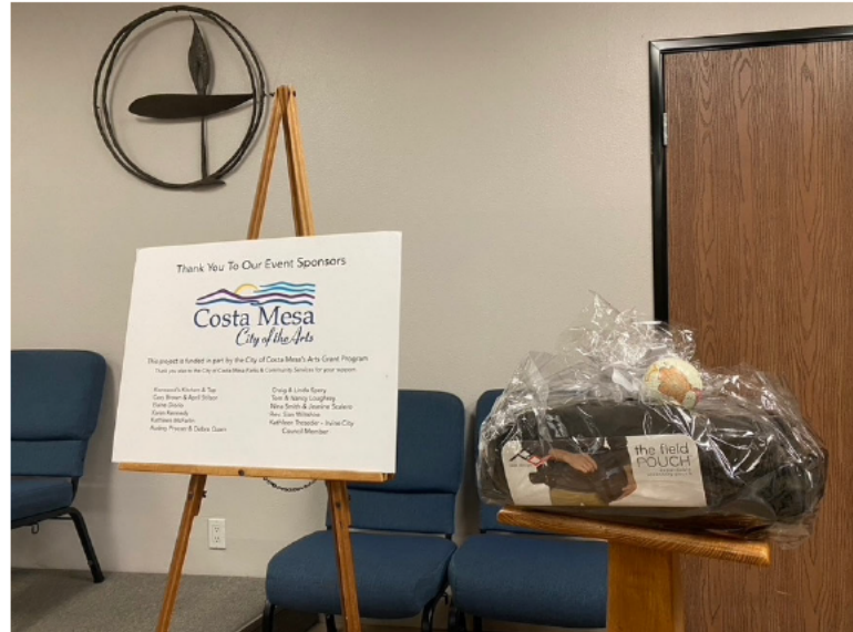
Poster thanking the event sponsors and a donated door prize given to a lucky attendee.

environmental category so we don't know if that affected our ticket sales, but possibly. Also, unfortunately, COVID may have been a factor since the number of cases were rising again, and the next booster had just been announced. We had hoped to sell more tickets but as we all know Costa Mesa, and the surrounding community, has a variety of great artistic and environmental activities to choose from every weekend, which is one of the best reasons we all are fortunate to live in this area.