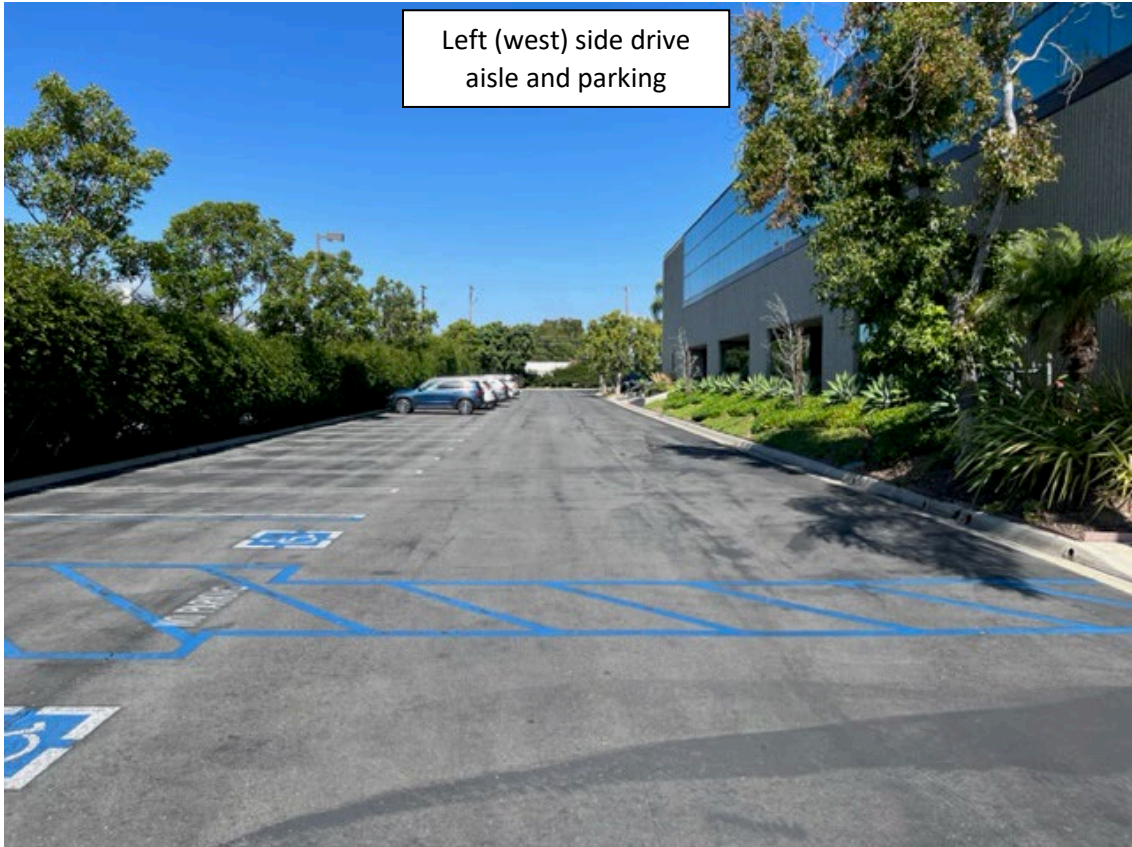
Left (west) side drive aisle and parking