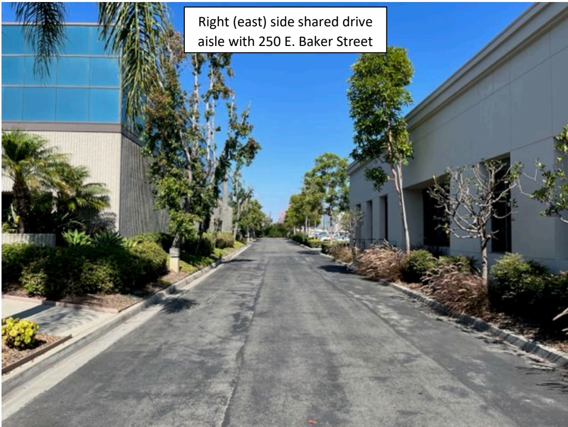
Right (east) side shared drive aisle with 250 E. Baker Street