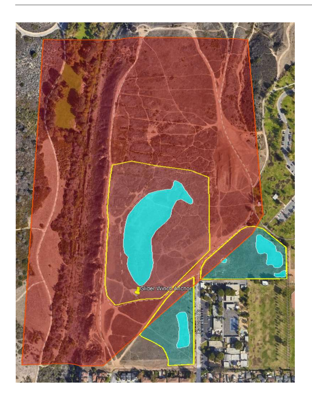
Figure 2. Current HSS designated operating area (red) with vernal pool watershed overlays (yellow)