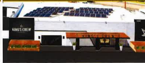
CORONA KING'S CREW

2021E REVENUE: n/a 2022E REVENUE: $4.9M* Opening in Q3 2022