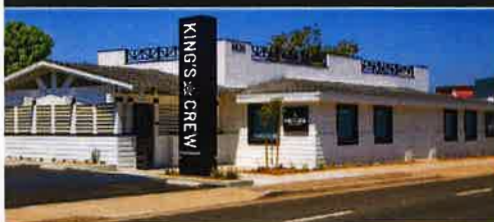
LONG BEACH KING'S CREW

2021E REVENUE: $7.3M 2022E REVENUE: $9.5M