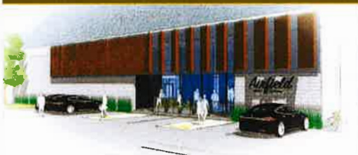
REDWOOD CITY AIRFIELD SUPPLY CO.

2021E REVENUE: n/a 2022E REVENUE: $16.7M* Opening in Q1 2022