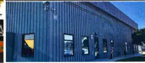
GREENFIELD 1 HIGHER LEVEL

2021E REVENUE: $1.7M* Opened in Q3 2021 2022E REVENUE: $10.8M