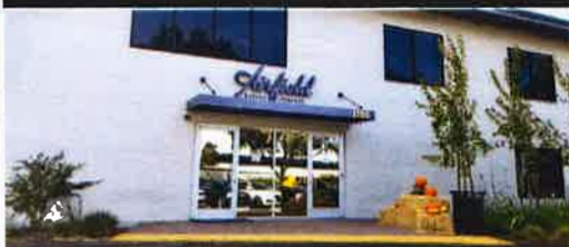
SAN JOSE AIRFIELD SUPPLY CO.

2021E REVENUE: $34.2M 2022E REVENUE: $35.2M