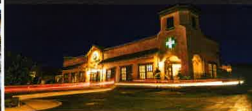
SEASIDE HIGHER LEVEL

2021E REVENUE: $10.6M 2022E REVENUE: $11.1M