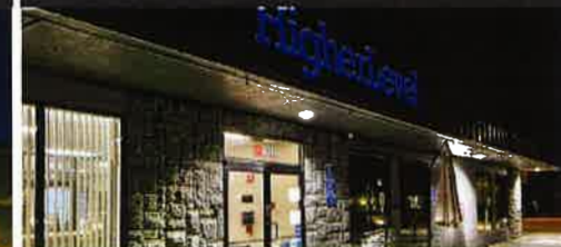
HOLLISTER HIGHER LEVEL

2021E REVENUE: $11.7M 2022E REVENUE: $12.4M