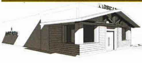
COSTA MESA KING'S CREW

2021E REVENUE: n/a 2022E REVENUE: $5.3M* Opening in Q2 2022