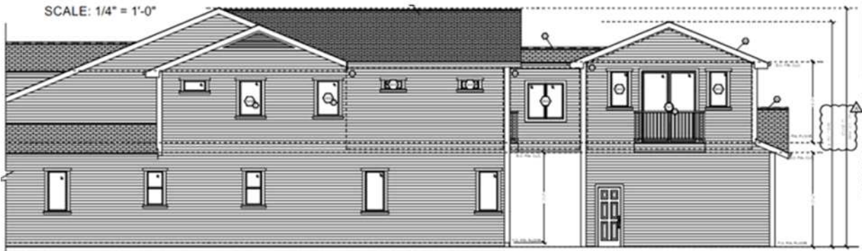
Previously Proposed Elevation