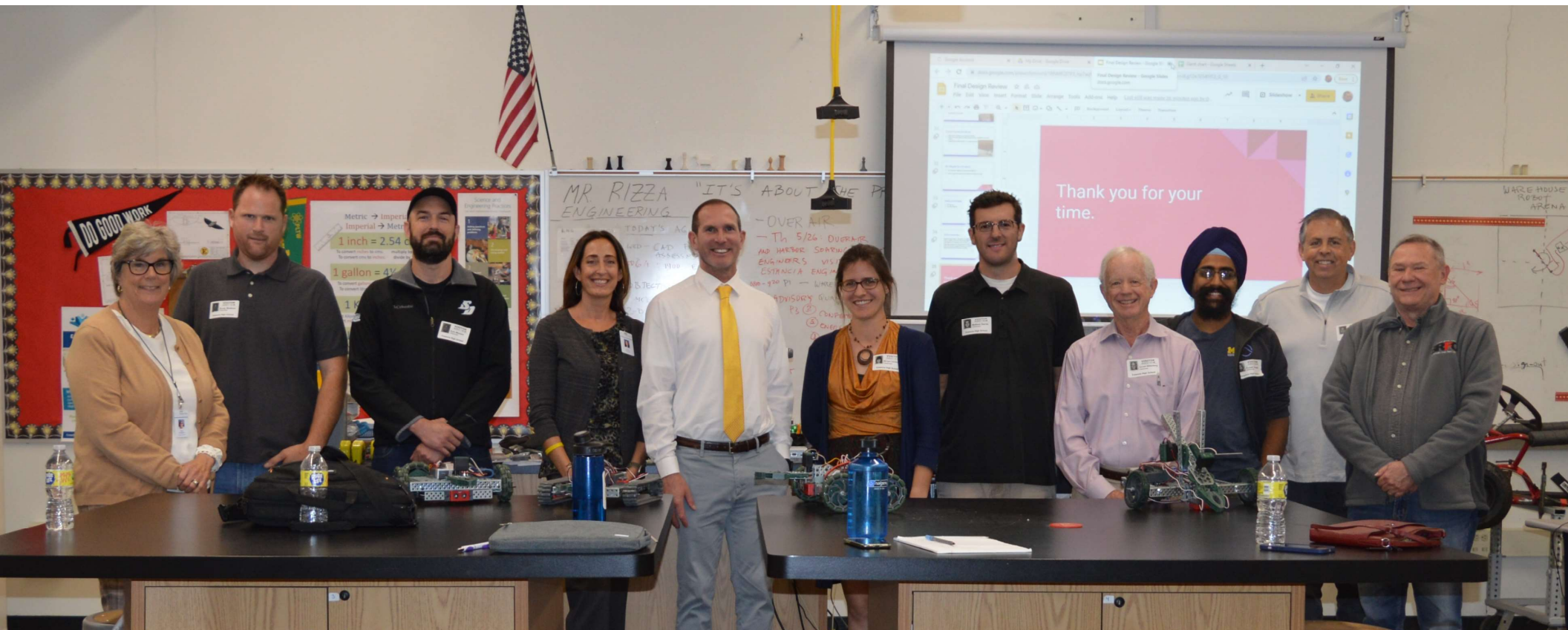
Harbor Soaring Society Supports Engineering at Estancia High School