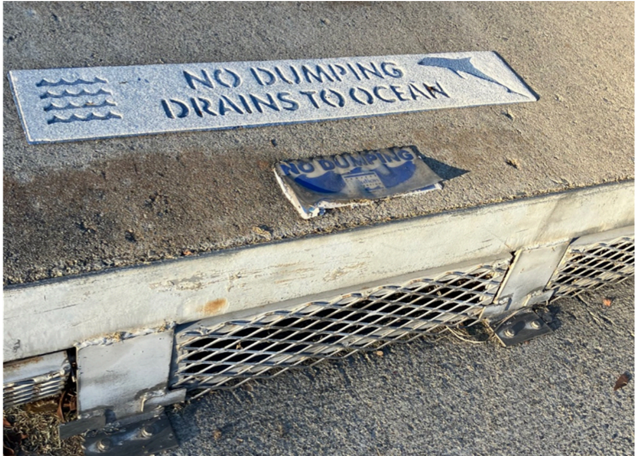
Metal screens cover the inlet to storm drain in Mesa Verde neighborhood.

At the curbside, simple metal screens can be placed over the collection points for storm drains that discharge to Randall Preserve or neighboring Talbert Regional Park, as seen below.