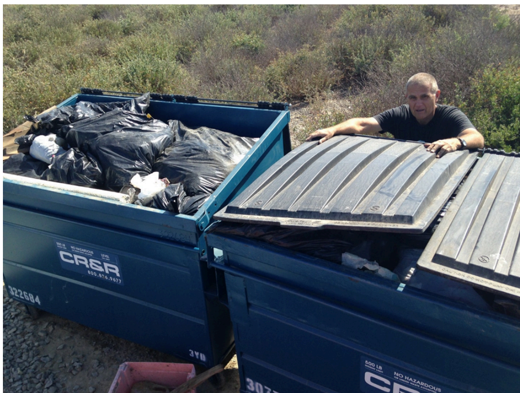
At least two dumpsters full of trash and other debris were collected on 9/16/17.