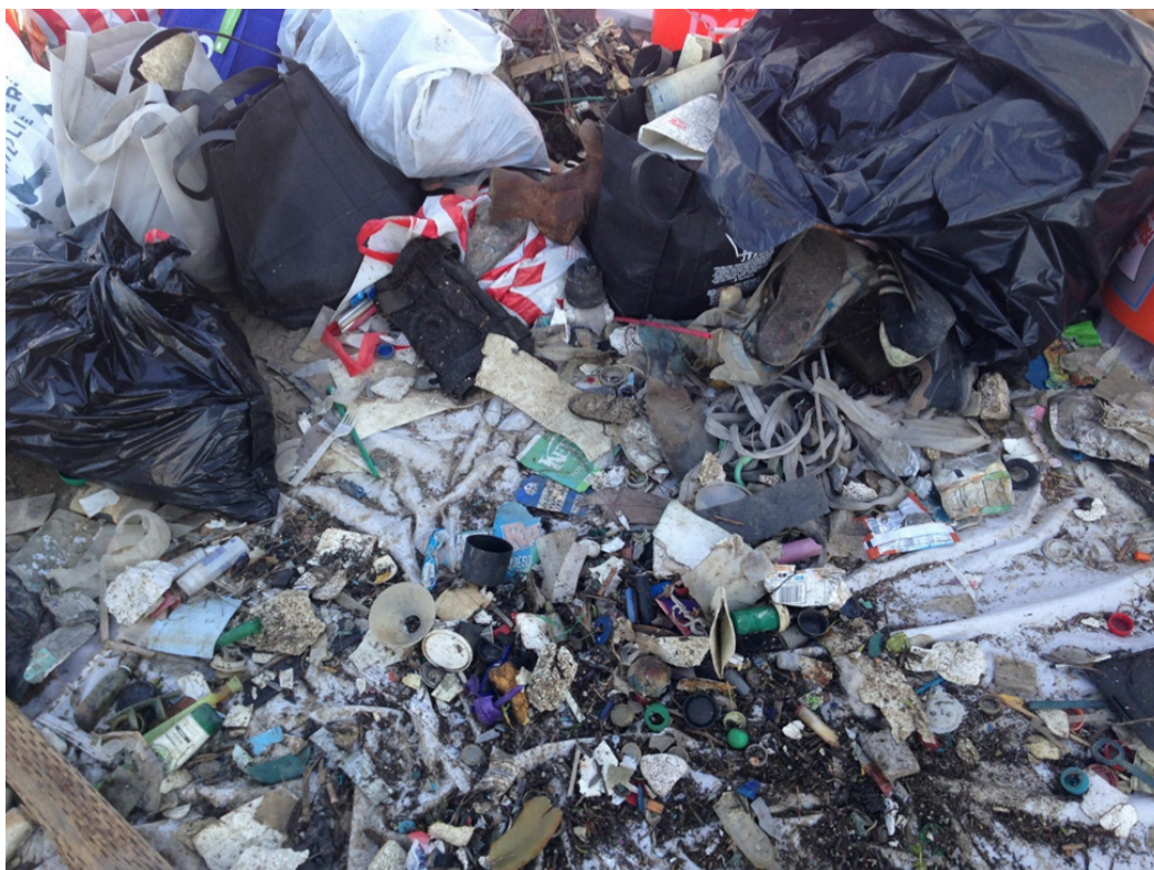
Sample of trash and debris collected from ACOE wetlands on 9/16/17.