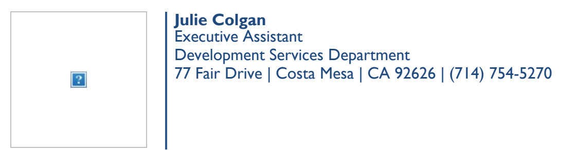
"The City of Costa Mesa serves our residents, businesses and visitors while promoting a safe, inclusive, and vibrant community."

City Hall is open to the public 8:00 a.m. to 5:00 p.m. Monday through Thursday and alternating Fridays, except specified holidays. Appointments can be made online at <u>www.costamesaca.gov/appointments</u>.