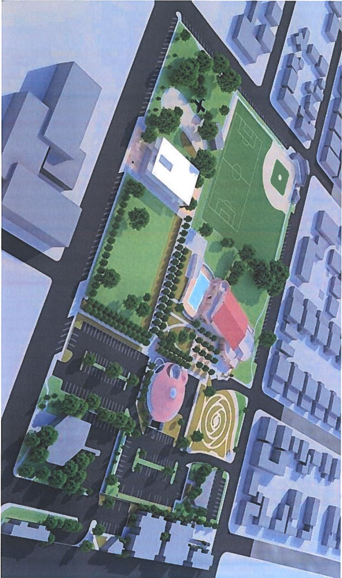
Exhibit A Description of Licensed Area