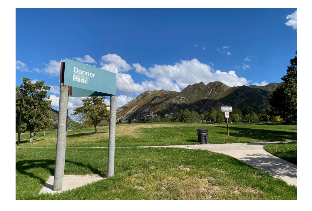
Figure 2: Donner Trail Park sign, located on the west end of the park, looking east. The Wasatch Range is in the background.