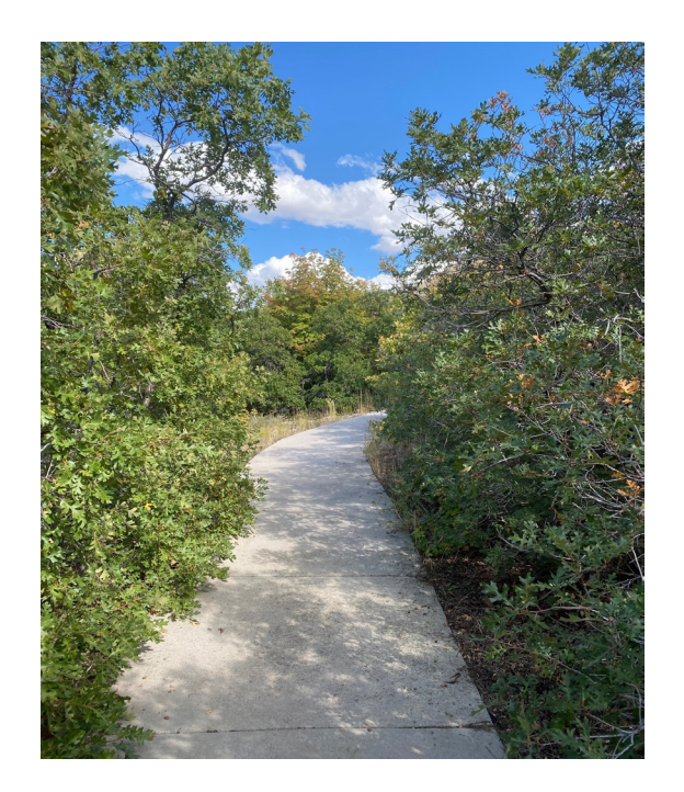
Figure 4: Secluded nature path loop located on the north side of the park.

Figure 3: View looking west from the park's central field. The Salt Lake Valley and the Downtown skyline are seen in the background.