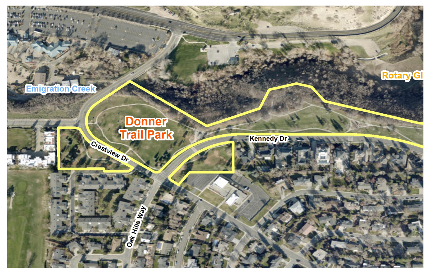
Figure 1: Donner Trail Park Boundry Map. Click here to see the park on Google Map

Figure 2: Donner Trail Park sign, located on the west end of the park, looking east. The Wasatch Range is in the background.