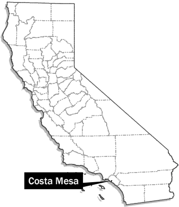
Fire Hazard Severity Zones (FHSZ) in Local Responsibility Area (LRA), as Identified by the State Fire Marshal