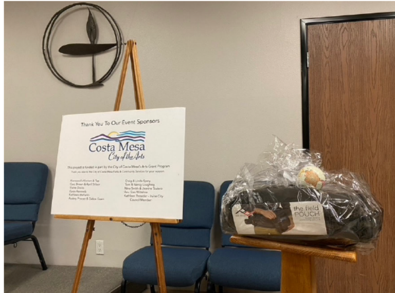
Poster thanking the event sponsors and a donated door prize given to a lucky attendee.

environmental category so we don't know if that affected our ticket sales, but possibly. Also, unfortunately, COVID may have been a factor since the number of cases were rising again, and the next booster had just been announced. We had hoped to sell more tickets but as we all know Costa Mesa, and the surrounding community, has a variety of great artistic and environmental activities to choose from every weekend, which is one of the best reasons we all are fortunate to live in this area.