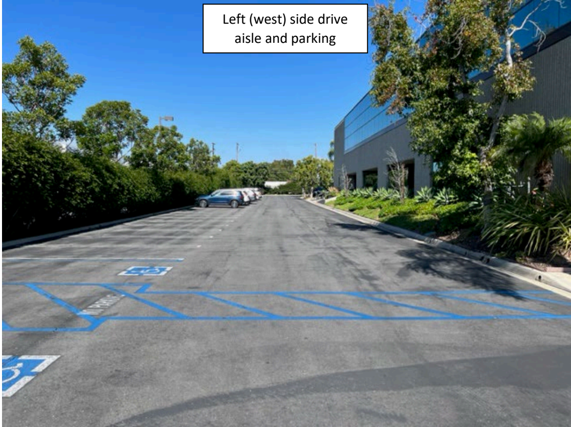
Left (west) side drive aisle and parking