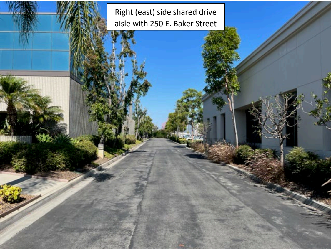
Right (east) side shared drive aisle with 250 E. Baker Street