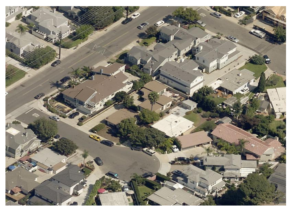
East-facing aerial view of existing site