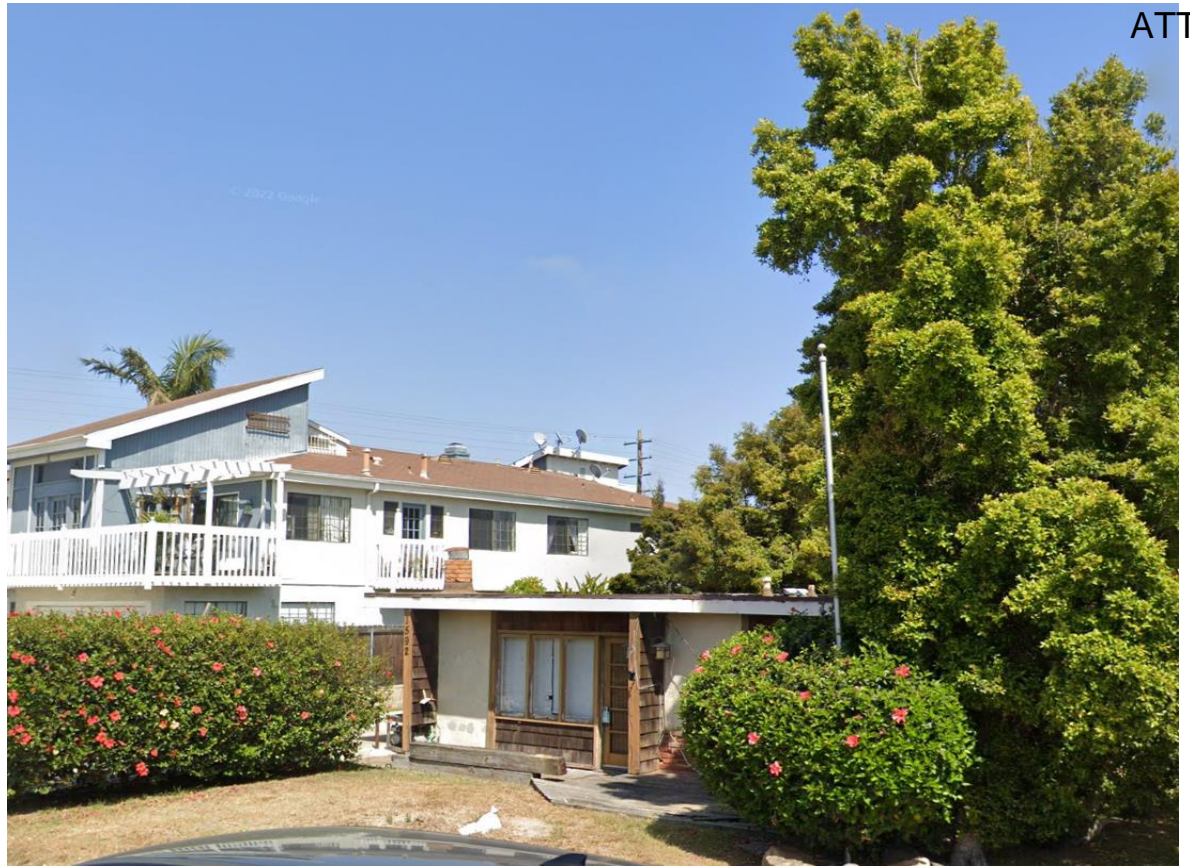
East-facing street view of existing site as seen from Redlands PI